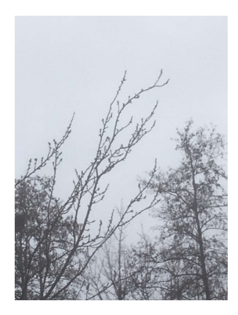
zo'n druilerige dag, drijfnat dat je de verstrijkende tijd vergat.

Het is heel wat het zien groeien van het blad.