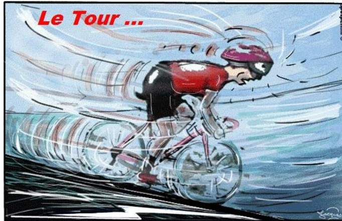
Hoe gemakkelijker je gaat, hoe moeilijker het gaat ...

Wielrennen met de benen malen pedaleren en stoempen.